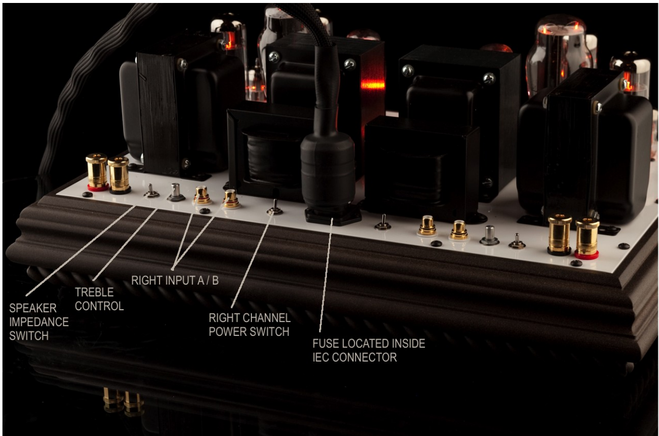
TORII MK III – Rear View

This amplifier was built in two halves. Each half is a mirror image of the other. This includes the jacks on the back and even all the parts on the inside. There are two power switches, one for each side. Below the switches and jacks have been labeled in the picture. The non-labeled side is a mirror image of the labeled side.