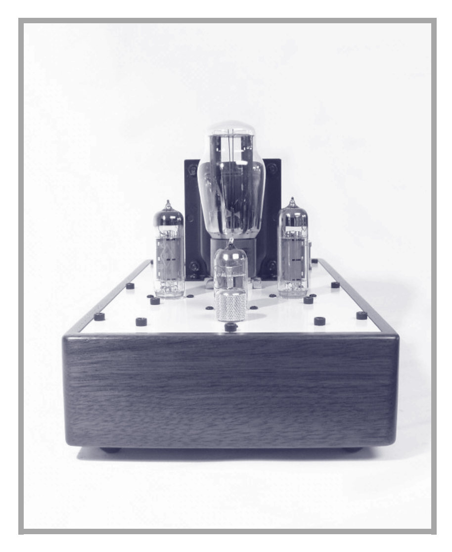
SE84TS (TABOO) OWNERS MANUAL